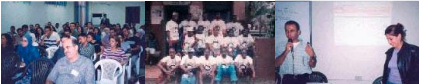
From Left: TakingITGlobal Youth Day meetings in Syria, Ghana, and Jordan

The ultimate mission of TIGYD is that of reinforcing the central tenets of TakingITGlobal - to inspire, inform, and involve young people around the world - with the added element of celebrating both our organization and membership's achievements.