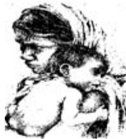
July 2003 Contest 2nd Runner-Up