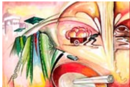
July 2003 Contest 1st Runner-Up