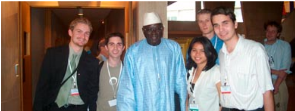
Above: Members of the Youth Caucus at the WSIS Intersessional Meeting in Paris, France.

At the meeting, the Youth Caucus lobbied to ensure the paragraph on youth was kept in the Declaration despite more than two thirds of its length being cut. The Youth Paragraph for WSIS remains by far the strongest of any UN Summit held (in last year's Johannesburg Summit on Sustainable Development, youth barely rated a mention).