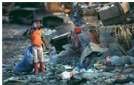
July 2003 Contest 3rd Runner-Up

stats, and an 'Of the Week' component, which showcases a new exhibit and collection each week.