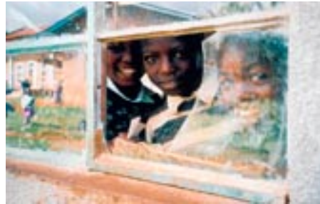
July 2003 Contest Winner

The introduction of collections allows for collaboration among our members and offers a new and interesting way for artists to interact with the Gallery and each other. Other new features include an advanced search tool, Global Gallery and Artist