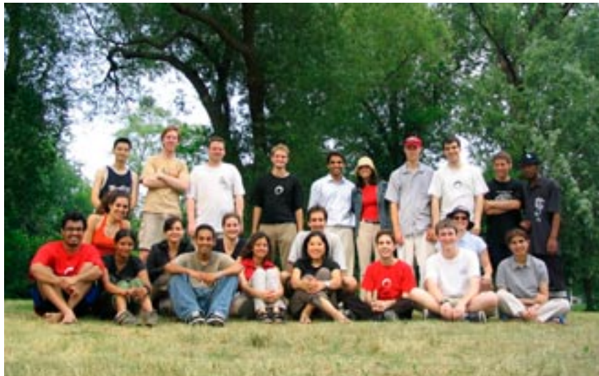
TakingITGlobal staff retreat at the Centre Island, Toronto, Canada