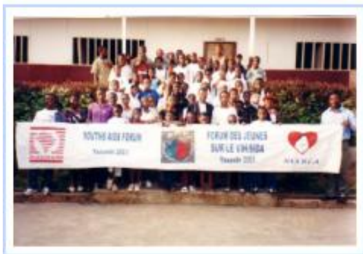
World AIDS Day 2003, National Students' Union for the Control of AIDS, Cameroon