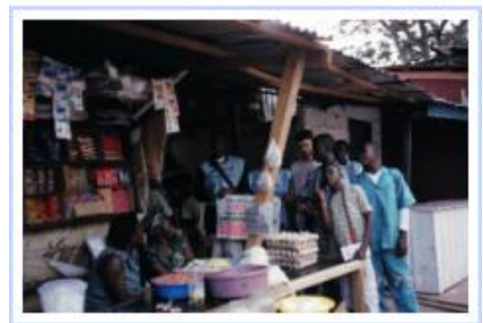
Canadian Volunteer spending time with ARYI Cameroon member organization